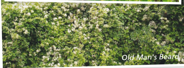
Old Man's Beard