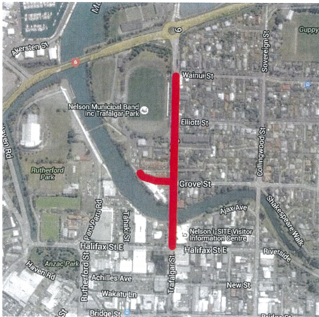
Figure 2—Map of the Road Closures for the Nitro Circus