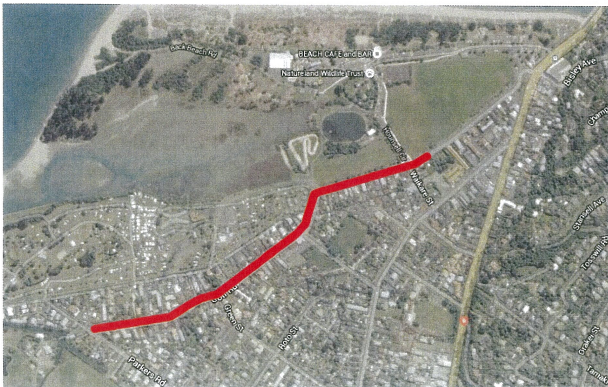
Figure 4—Map of Road Closures for the Kiwi Kids TRYathlon